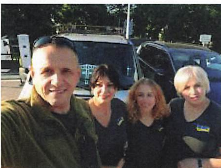
Wounded soldier ministry.Ukrainian Christian Psychologists.jpg 333K