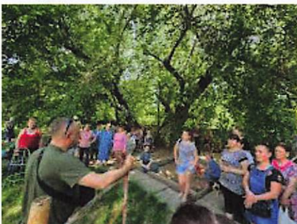
Preaching the Gospel before aid.sheltering out of sight of drones.bombs.jpg 237K