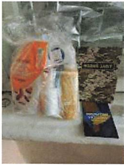
Bibles and aid for soldiers.jpg 217K