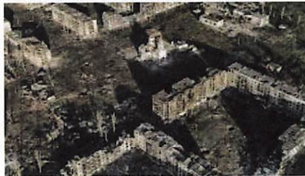
Kherson region today.1.jpg 210K