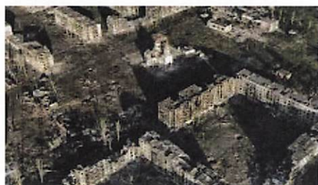
Kherson region today.1.jpg 210K