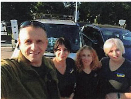
Wounded soldier ministry.Ukrainian Christian Psychologists.jpg 333K