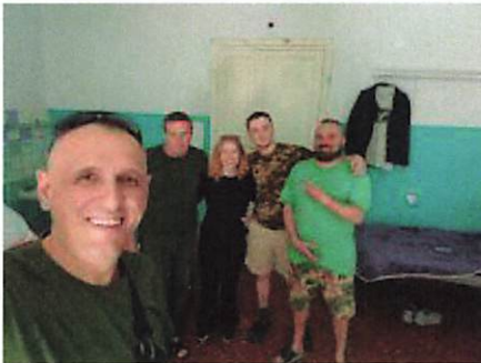
wounded soldier ministry.Kherson.jpg 218K