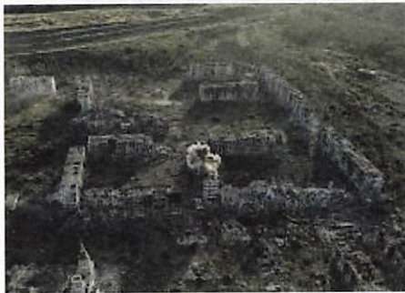
Kherson region today.jpg 211K