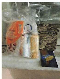
Bibles and aid for soldiers.jpg 217K