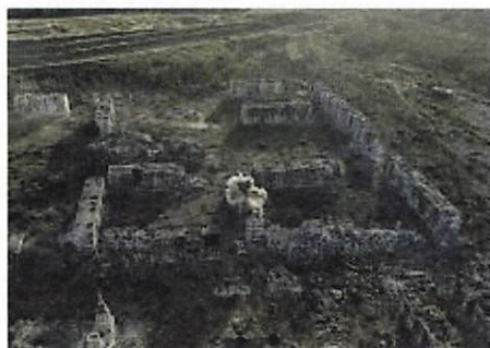
Kherson region today.jpg 211K